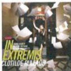
CLOTILDE RULLAUD IN EXTREMIS 1 CD TZIG/CODAEX

NEW. In our December 2010 issue devoted to female jazz singers, we sketched a portrait of Clotilde Rullaud, in which she saw jazz as a melting pot blending many different types of world music. In this, her first studio album (after a previous live recording), she remains as good as her word. The jazz here is present in inspiration and expressive technique only, rather than through a "repertoire" as such, with the exception of a tune by Bill Evans and another by Monk. A bit like Nougaro (indeed African Sketches recalls the Toulouse singer's Locomotive d'Or ), it is the marriage of words and texts (often poetic) with the music that interests the singer above all, and which forms the very essence of the album. Baden Powell, Sting and Piazzolla, as well as several jazz tunes, are thus reinvented with a desire for originality that provides the whole album with an undeniable artistic unity. Although Clotilde Rullaud undoubtedly owes the success of this recording to her background as an instrumentalist (she is a flutist), she also owes it to her unusual trio (without bass) composed of top-class musicians who are much more than simple accompanists. An original and successful album for all those who like their jazz a little differently.